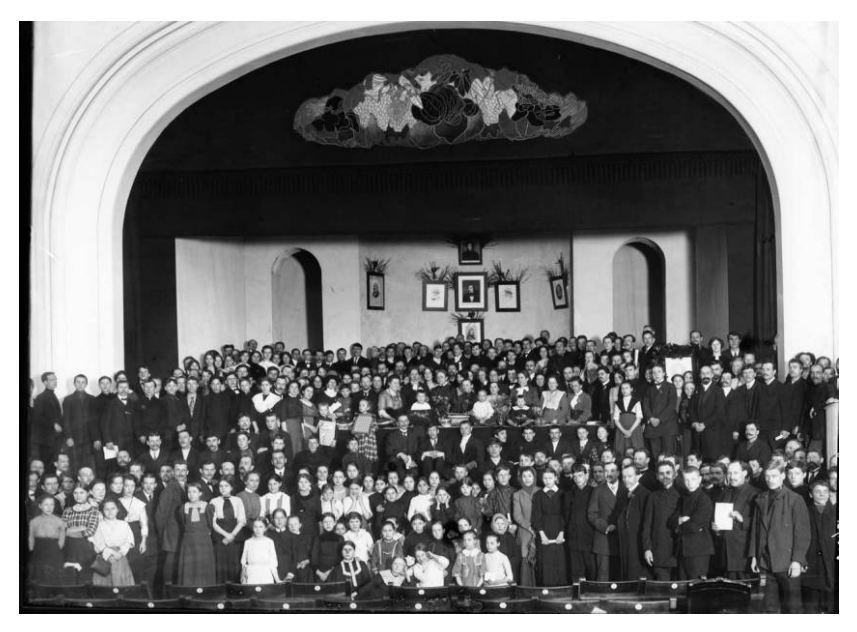
FIG 2. —Celebrating the tenth anniversary of the Ligovsky People's House, April 7, 1913.

culture as the best means of integrating the lower classes into the political, social, and cultural life of the nation. Throwing a bridge across the divide between rich and poor, another objective of all such institutions, often proved easier to aspire to than to achieve. In an examination of cross-class relations within London's Oxford House, for example, Seth Koven writes about "the world of difference between proclaiming the virtues of democracy and acting democratically; between saying you love your brother and being loved in return by him."<sup>137</sup> Similarly, it would be an exaggeration to claim that equality and democracy ruled at Panina's People's House; differences based on class, wealth, and education were not erased or forgotten. Despite their generally upbeat tone, the LND's reports acknowledge that, in the words of the tenthyear report, "dissatisfaction, criticism, disunity, failures, and distress" did arise.<sup>138</sup> Rowdy spectators disrupted the theatrical performances, and the goal of designing an effective educational program proved elusive. A coworker in the children's section confessed to losing his faith in the LND completely when "an entire horde of hooligans" destroyed the garden in